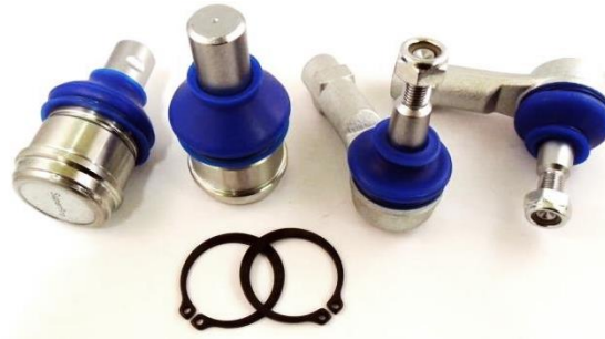
Figure 1: Kit contents