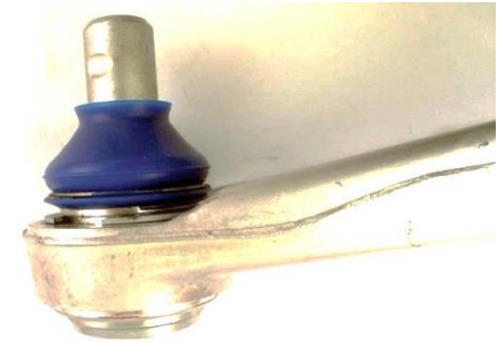
Figure 2: Roll centre ball joint assembled in control arm